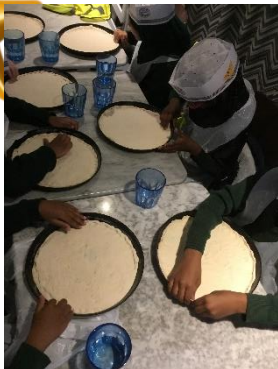
We pressed around the edge to make a crust

Topic: We had a fantastic trip to Pizza Express and made our own pizzas. The children really enjoyed this – especially eating them! We are learning about healthy eating using the Eatwell Plate. In geography, we have found out about some very interesting foods from different parts of the world. Does anyone want to try some deep fried tarantulas or raw blood soup?