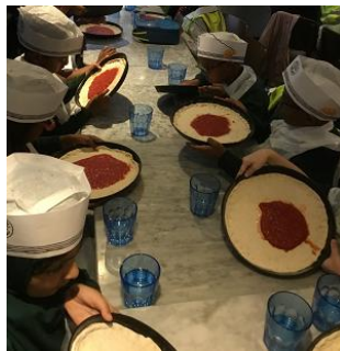
We tried spreading the sauce by tilting and tapping...