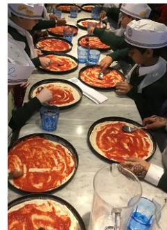
...but most of us found it easier with a spoon!