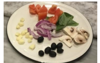
We tasted some different ingredients and toppings.