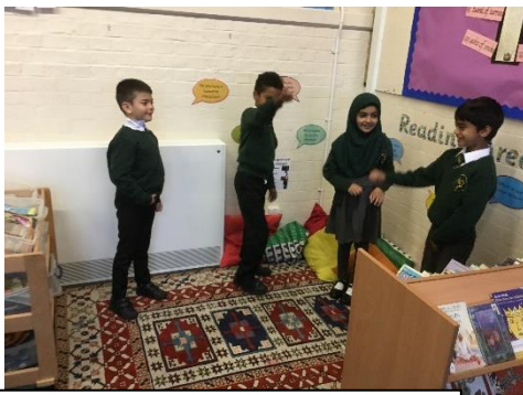
The children did some role playing to think about how workers in tea plantations might feel.